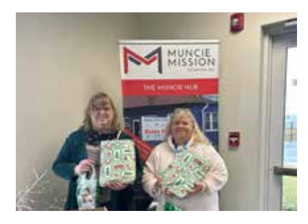
PrimeTrust Charity Committee Gives Back

From jeans days to pie sales, the PrimeTrust team rallied together to support our local community.